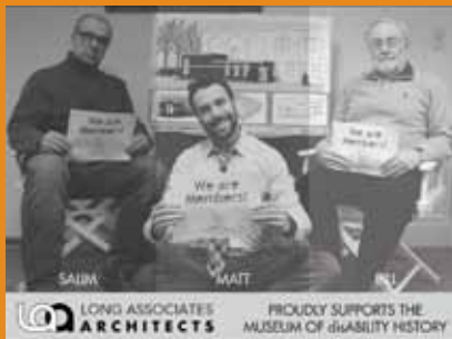
William L. Long Associates