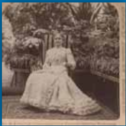
First Lady Ida Saxton McKinley

First Lady Ida Saxton McKinley, wife of the 25th American President, William McKinley,