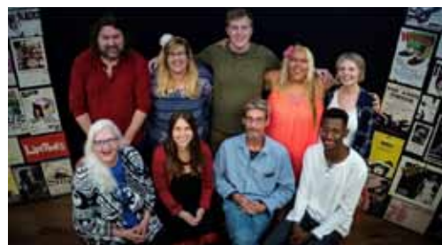
Cast and crew from "And Where Will You Put the Things You Save."

Did I listen to the people that tried to put me down? No way!