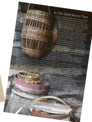
The Colony Chronicles book cover and a page from the interior.