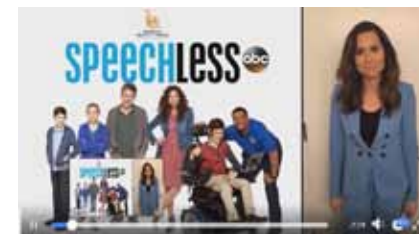
Screenshot of the Speechless cast congratulations video.