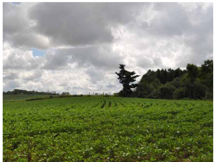
The 300 acres of farm land was one of the attractions of the Farnworth Farm for the Asylum. The land is still farm land today and includes the Halls Apple Farm on Ruhlmann Road in Lockport, NY.