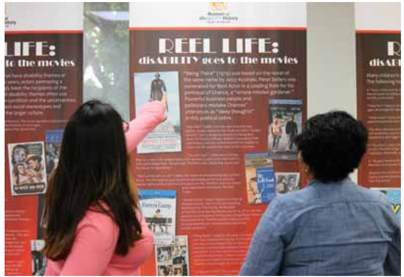
Traveling exhibit at Miami-Dade College Medical Library

Our traveling exhibits are available to rent and can be shipped directly to your organization for conferences and events. For more information on renting a traveling exhibit, send an inquiry to info@museumofdisability.org or call 716.629.3626.